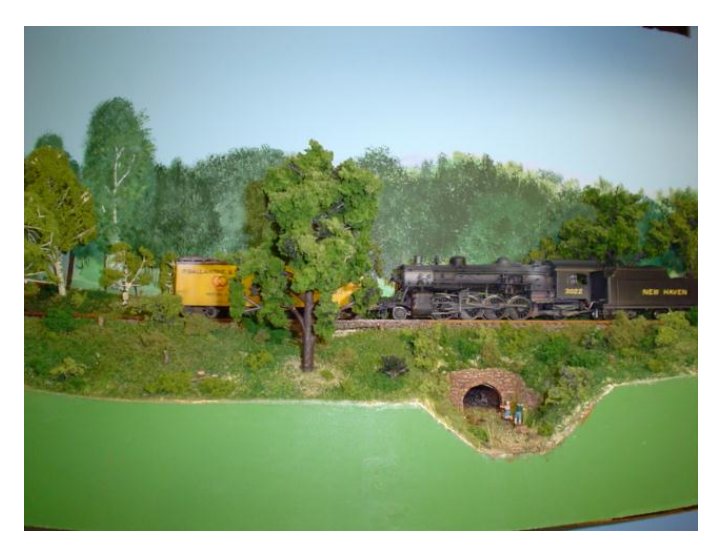
New Haven Railroad J-1 class 2-8-2 Mikado #3022 runs south from the Hartford Yard up the .83% grade to Wethersfield, CT. pushing a wood ice bunker reefer across Beaver Brook to its destination at the Ballantine Beer Warehouse.

I belong to the New Haven Historical & Technical Association (www.nhrhta.org). This is a great source of valuable information specific to the railroad you model if you model a prototype. As I began to gain knowledge about my railroad and get past all the technical data available I wanted develop an operating scheme for it. The best way to do this is to ask questions. Not only about a specific prototype car or engine but how and why the train was operated like it did. Forums are a good way to share this information and make new friends. I have gained a lot of knowledge on how, why and what specific trains did. The research is just as much fun as modeling. It becomes part of the reason why you model a certain area of the country, a specific region